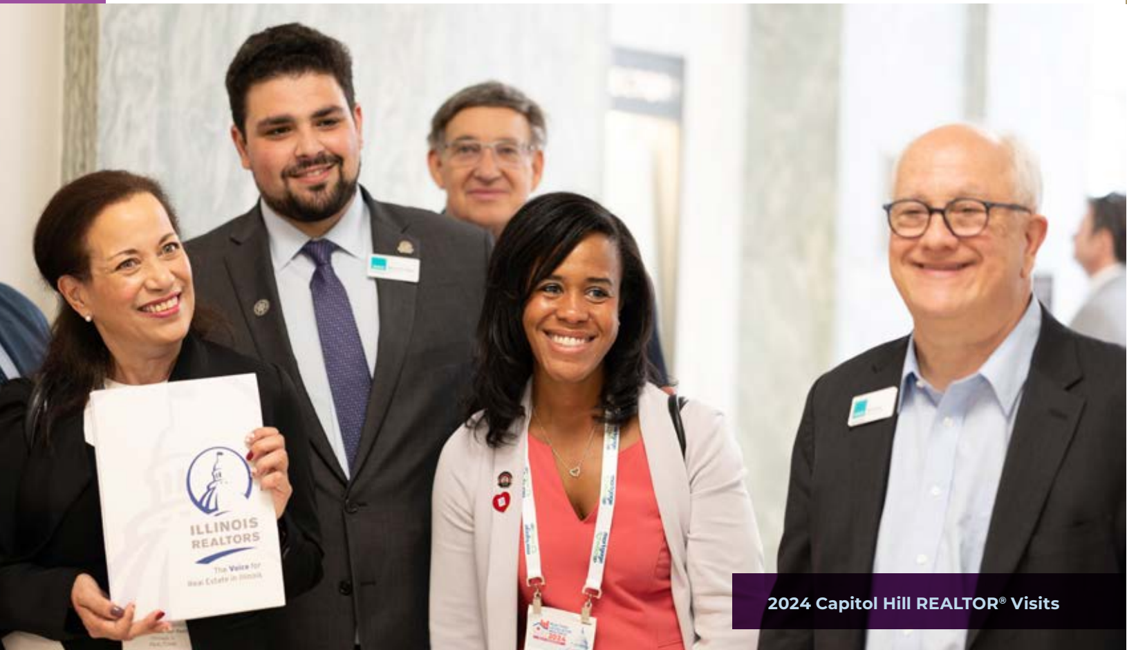
2024 Capitol Hill REALTOR® Visits

Contact: Christine Windle cwindle@nar.realtor // (202) 383-1135