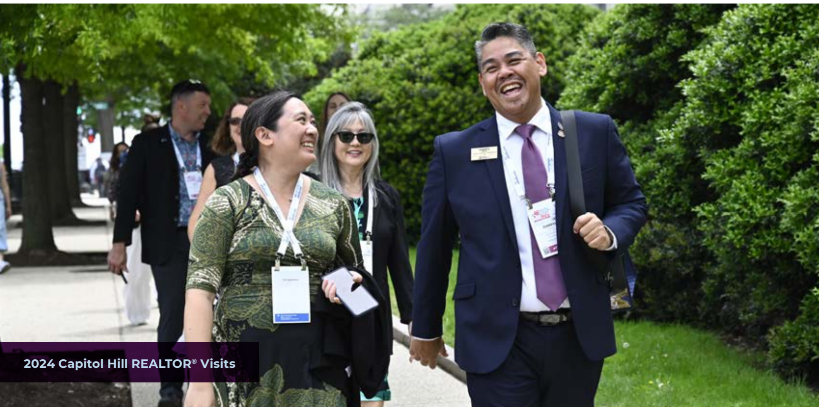
2024 Capitol Hill REALTOR® Visits