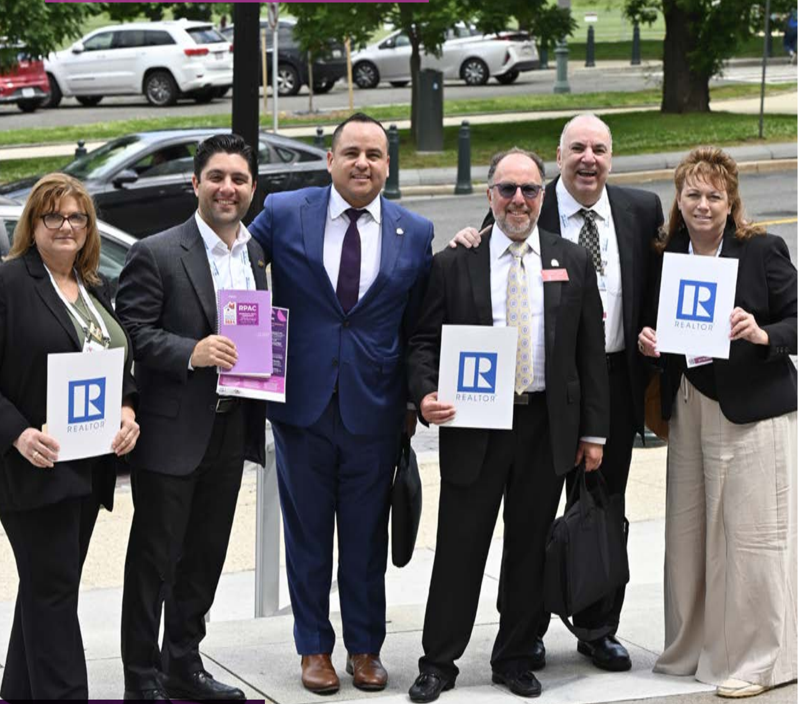
2024 Capitol Hill REALTOR® Visits

The REALTOR® Party is a powerful alliance of REALTORS® and REALTOR® associations working to advance public policies and support candidates that build strong communities, protect property interests and promote a vibrant business environment.