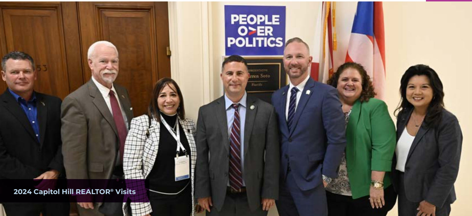
2024 Capitol Hill REALTOR® Visits

Contact: Victoria Givens vgivens@nar.realtor // (202) 383-1021